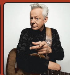
DEC 14 & 15 TOMMY EMMANUEL