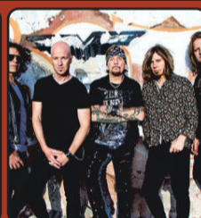
THU, DEC 29 Jack Russell's GREAT WHITE