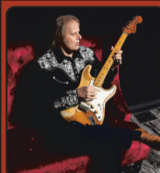
DEC 17 & 18 WALTER TROUT