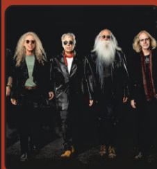
THU, DEC 8 IMMEDIATE FAMILY