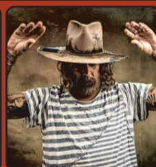
WED, DEC 28 DONAVON FRANKENREITER