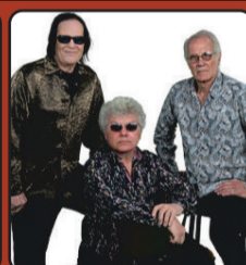
FRI, DEC 23 AMBROSIA