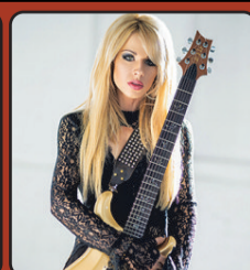
THU, JAN 26 ORIANTHI