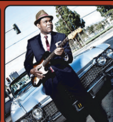
SAT, JAN 28 ROBERT CRAY

ticketweb 866.468.3399 33157 Camino Capistrano | San Juan Capistrano Like Us on facebook.com/coachhouseconcerthall | follow us on Twitter @coach_house