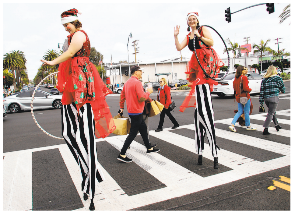
PERFORMERS FROM "Circus Joy" walk on stilts on Sunday.