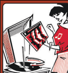
DEC 31 & JAN 1 THE ENGLISH BEAT