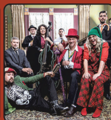
TUE, DEC 13 SQUIRREL NUT ZIPPERS