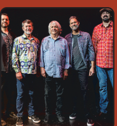
SUN, JUN 18 PURE PRAIRIE LEAGUE