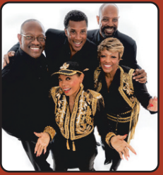
SAT, APR 15 THE 5TH DIMENSION