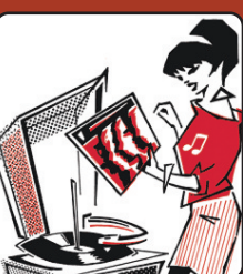
SAT, MAY 13 THE ENGLISH BEAT