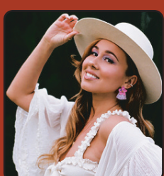
SUN, MAY 14 HALEY REINHART