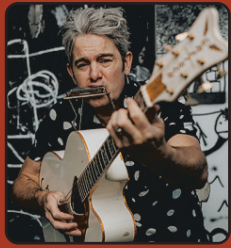
FRI, APR 7 G. LOVE & SPECIAL SAUCE