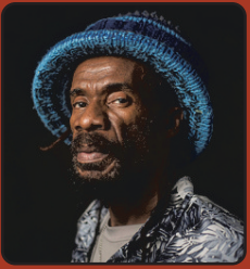
THU, APR 13 ISRAEL VIBRATION