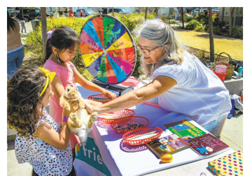
A VENDOR helps children during Costa Mesa's 2022 SpringFest.