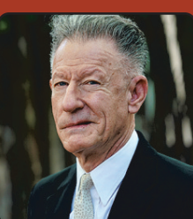
WED, JUL 5 LYLE LOVETT

ticketweb 866.468.3399 33157 Camino Capistrano | San Juan Capistrano Like Us on facebook.com/coachhouseconcerthall | follow us on Twitter @coach_house