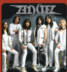
THU, APR 27 ANGEL