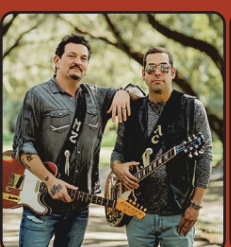
THU, MAY 11 BLOOD BROTHERS