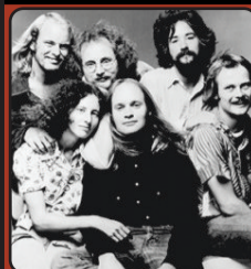
FRI, AUG 13 HONK