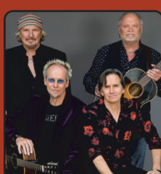
FRI, OCT 1 VENICE