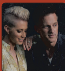
SUN, SEP 5 THOMPSON SQUARE