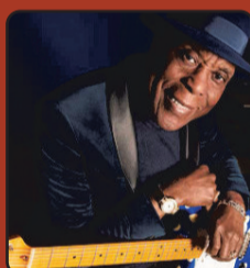
WED, SEP 8 BUDDY GUY