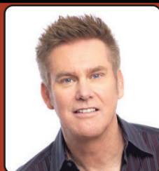
WED, AUG 25 BRIAN REGAN