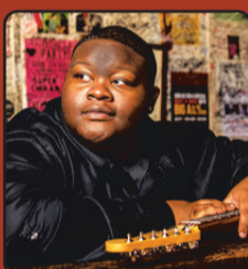
FRI, SEP 10 CHRISTONE "KINGFISH" INGRAM