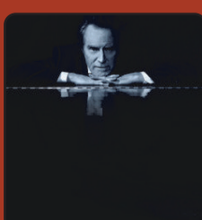
FRI, OCT 8 JD SOUTHER

ticketweb 866.468.3399 | 33157 Camino Capistrano | San Juan Capistrano Like Us on facebook.com/coachhouseconcerthall | follow us on Twitter @coach_house