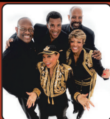
SUN, AUG 29 THE 5TH DIMENSION