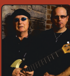
FRI, SEP 17 SAVOY BROWN