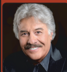
WED, SEP 1 TONY ORLANDO