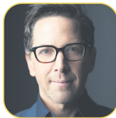
Dan Bucatinsky (Scandal)