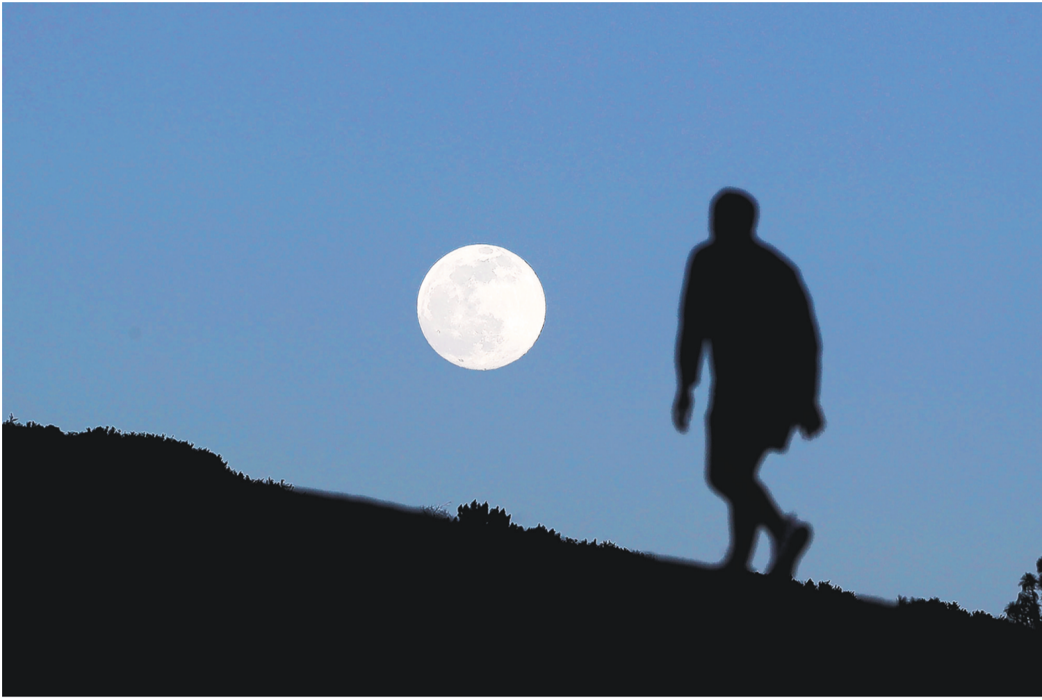
A HIKER WALKS UP a trail as the full “wolf moon” arrives in the eastern sky in Laguna Beach on Wednesday. Coastal communities are preparing for a winter storm expected to last Thursday night into Friday, with sandbags available to residents in Laguna Beach, Newport Beach and Huntington Beach.

FRIDAY, JANUARY 29, 2021 /// Now including Coastline Pilot and Huntington Beach Independent /// dailypilot.com