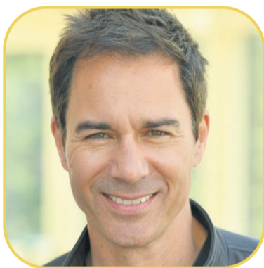
Eric McCormack (Will & Grace)