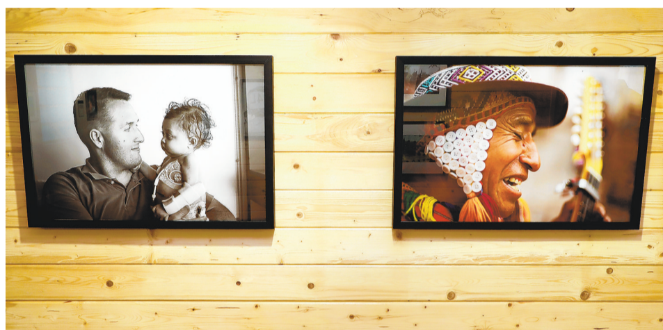
PHOTOGRAPHY BY Fountain Valley resident Giovanni Berdejo at "Through Their Eyes" exhibit

sara.cardine@latimes.com Twitter: @SaraCardine