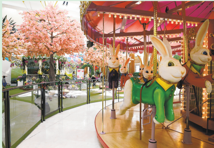
A BUNNY CAROUSEL draws attentions of young visitors to "Springtime Gardens" at Costa Mesa's South Coast Plaza.

Others made a day out of it, stopping by the gardens on their way to one of a number of area restaurants that recently re-