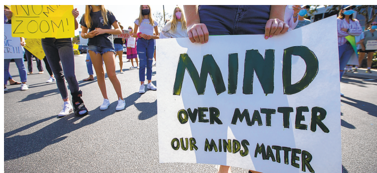
PROTESTERS hold signs during Thursday's demonstration.