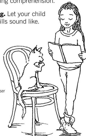
Illustration © 2023 Robin Preiss Glasser

Be a model of fluent reading. Let your child hear what strong reading skills sound like.