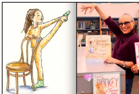
Illustration © 2023 Robin Preiss Glasser

See and hear stories presented by these creators: