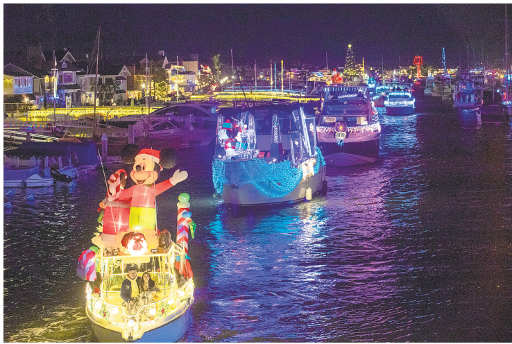
NEARLY 100 boats participate in the opening day of the Newport Beach Christmas Boat Parade in December 2021.

Roughly a quarter of this year's entrants are likely first-time participants, according to Rosansky, but many are returning entrants who look to step up the decorations and competition every year including parade