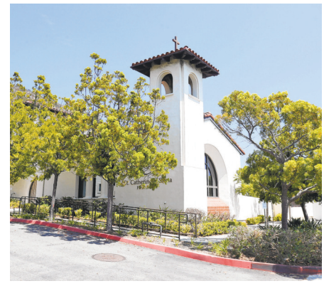
LAGUNA BEACH has closed escrow on its acquisition of the St. Catherine of Siena school property from the Diocese of Orange.