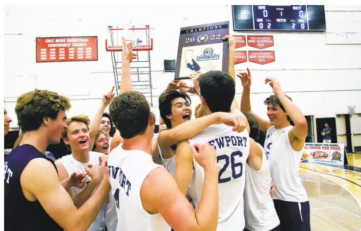
THE NEWPORT HARBOR boys' volleyball team celebrates after beating Loyola in the CIF Southern Section Division 1 final at Long Beach City College on May 14.