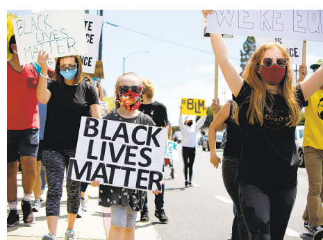
A LARGE number of protesters marched on Irvine Avenue in Newport Beach on Saturday.

Protests have been happening around the county and the nation for two