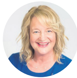
Katrina Foley, Honorable Mayor of Costa Mesa