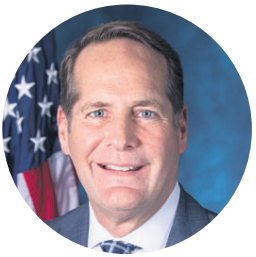
Congressman Harley Rouda 48th District, California