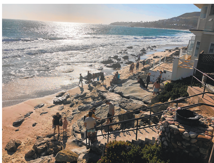
A SECTION of Laguna Beach was closed Monday due to a sewage spill.