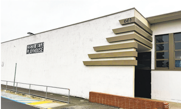
Costa Mesa Playhouse

“My only wish is that we get a little more time to conclude our current season and have a graceful