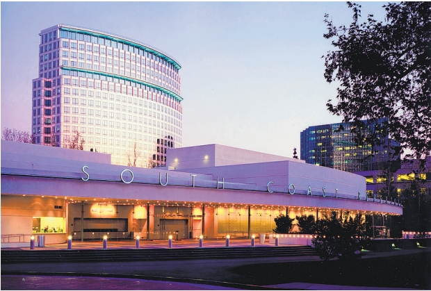
South Coast Repertory

"The NEA will now prioritize projects that elevate the nation's (historically Black colleges and universities) and Hispanic Serving Institutions, celebrate the 250th anniversary of American independence, foster AI competency, empower houses of worship to service communities, assist with disaster