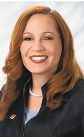
City of Costa Mesa

"I did feel it was in the best interest of the city to part ways under the no-fault provision of the city manager's contract," he