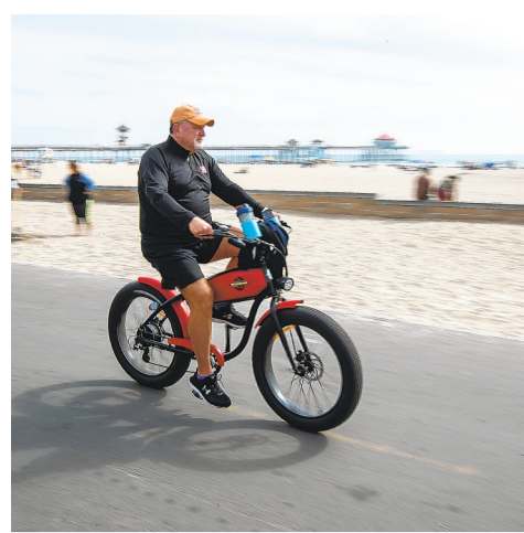
A MAN RIDES an e-bike on the bike path in Huntington Beach in 2021.

matthew.szabo@latimes.com Twitter: @mjszabo