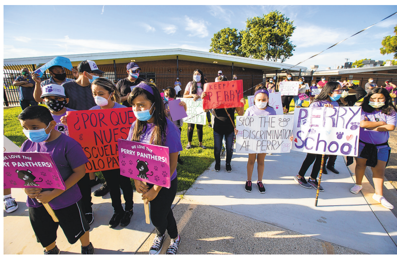
STUDENTS AND FAMILY members carry signs on the Perry Elementary School campus on Tuesday.