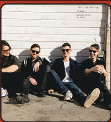
WED, SEP 20 PHANTOM PLANET