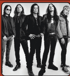
FRI, SEP 1 BANG TANGO