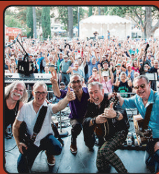
SAT, SEP 16 THE FENIANS