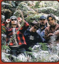
SUN, AUG 6 MICHIGAN RATTLEERS