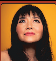
THU, SEP 21 KEIKO MATSUI