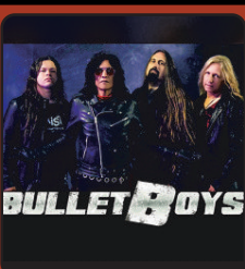
FRI, OCT 6 BULLET BOYS

ticketweb 866.468.3399 | 33157 Camino Capistrano | San Juan Capistrano Like Us on facebook.com/coachhouseconcerthall | follow us on Twitter @coach_house