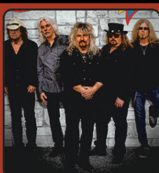
SUN, SEP 24 MOLLY HATCHET