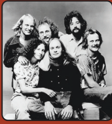
SAT, AUG 5 HONK