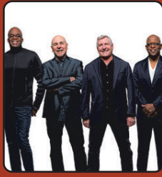
FRI, AUG 18 SPYRO GYRA