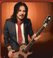
THU, AUG 31 GILBY CLARKE