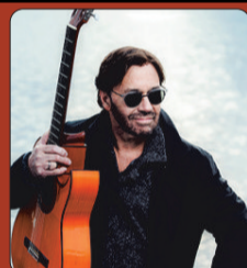
WED, OCT 9 AL DI MEOLA