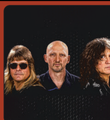
THU, OCT 3 ZEBRA