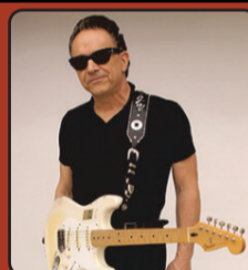
WED, OCT 16 JIMMIE VAUGHAN