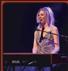
THU, SEP 26 DEBBIE GIBSON