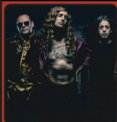
FRI, OCT 4 LOVE REIGN