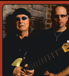
FRI, SEP 17 SAVOY BROWN