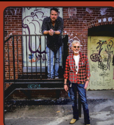
THU, SEP 23 Billy Bob Thornton & THE BOXMASTERS