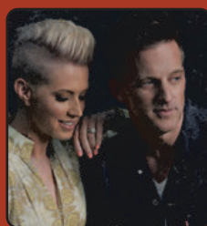
SUN, SEP 5 THOMPSON SQUARE