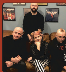
SAT, SEP 4 BOW WOW WOW