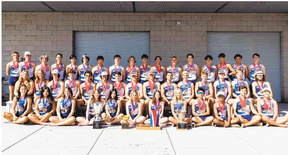
See Rowing , page A3 THE NEWPORT Sea Base junior rowing teams.

Mission accomplished, as Newport Sea Base finished the 2,000-meter race in 6 minutes, 36.35 seconds — nearly four