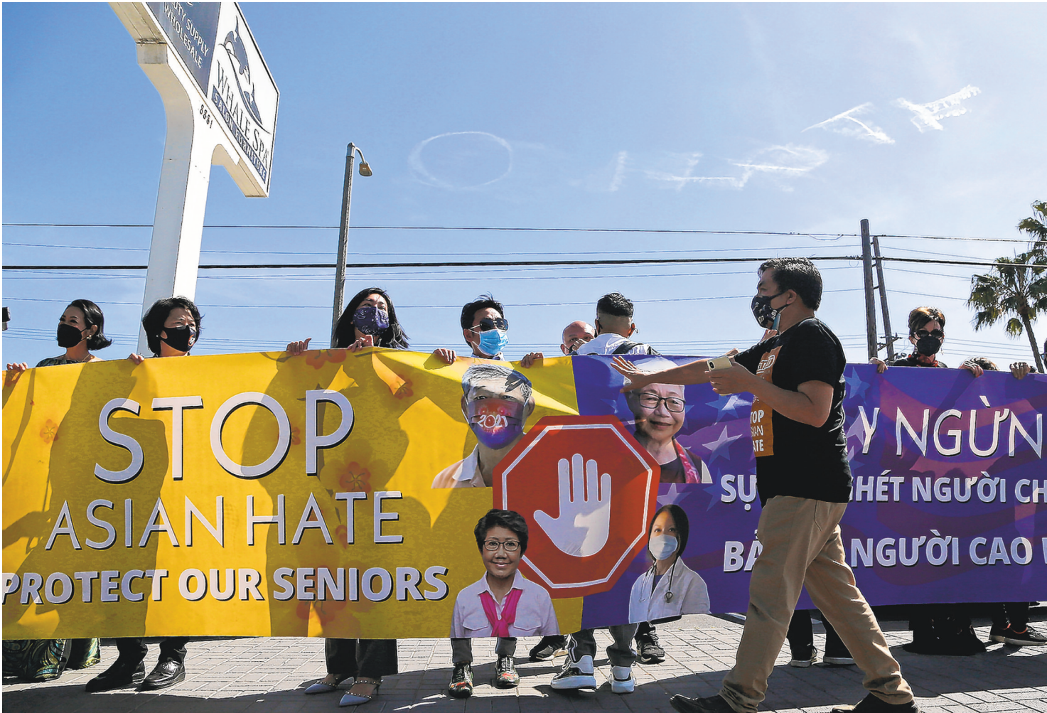
A GROUP GATHERS in front of Whale Spa Salon Furniture on Friday holding a large banner as an airplane skywrites "No Hate" at the end of a "Nailing It for America" news conference in Huntington Beach. A benefit concert is planned April 24 with proceeds to fight anti-Asian rhetoric and violence.