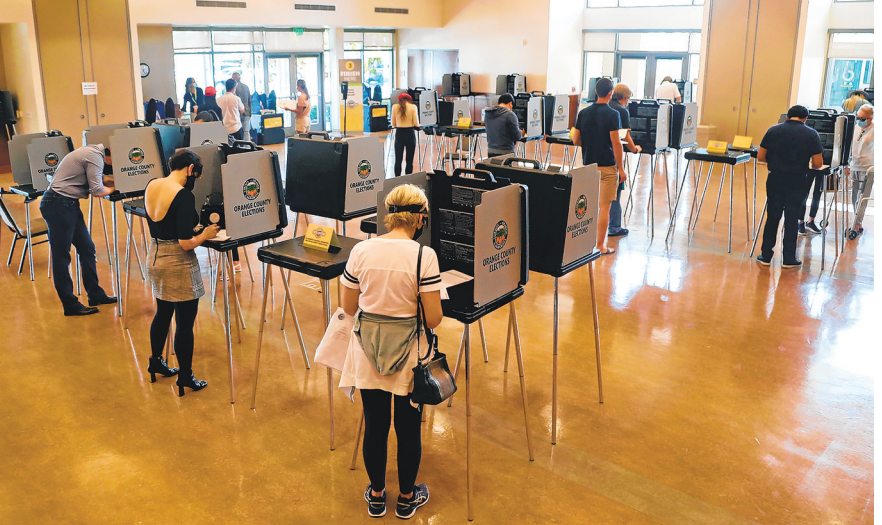
Kevin Chang Staff Photographer