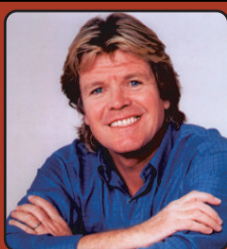
SUN, JAN 29 HERMAN'S HERMITS

ticketweb 866.468.3399 33157 Camino Capistrano | San Juan Capistrano Like Us on facebook.com/coachhouseconcerthall | follow us on Twitter @coach_house