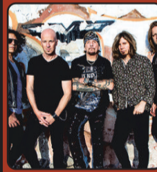
THU, DEC 29 Jack Russell's GREAT WHITE