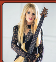
THU, JAN 26 ORIANTHI