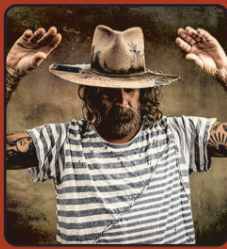
WED, DEC 28 DONAVON FRANKENREITER