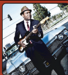
SAT, JAN 28 ROBERT CRAY