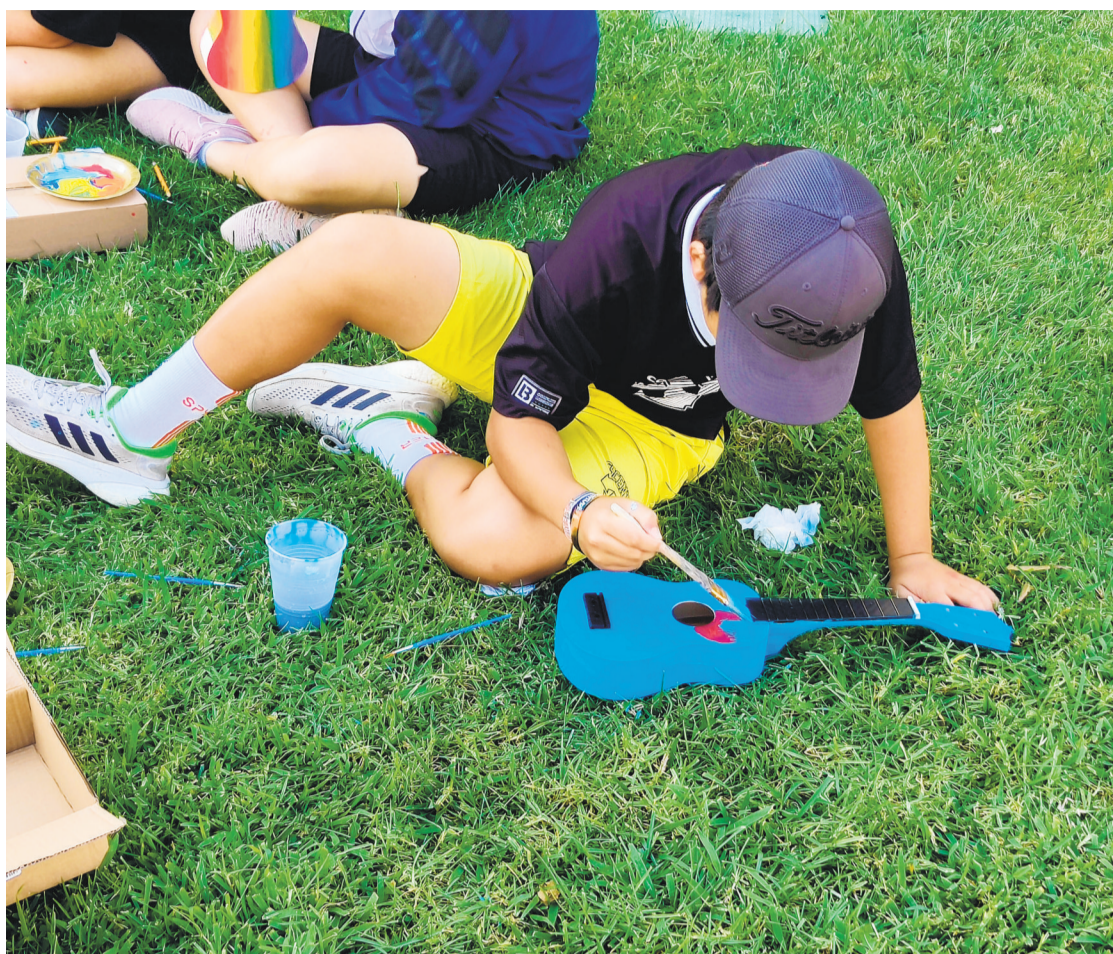
A DWYER MIDDLE SCHOOL student puts the finishing touches on while painting a ukulele. The project was funded through a $1,000 "mini-grant."

"We don't limit it to a specific type of art," Windle said. "We can fund the purchase of extra instruments, we can fund if they want to put on a produc-