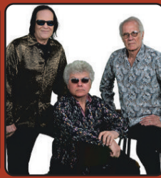
FRI, DEC 23 AMBROSIA