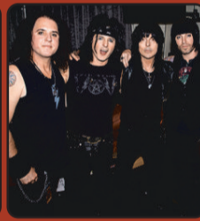
FRI, DEC 30 L.A. GUNS