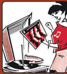
DEC 31 & JAN 1 THE ENGLISH BEAT