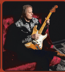
DEC 17 & 18 WALTER TROUT