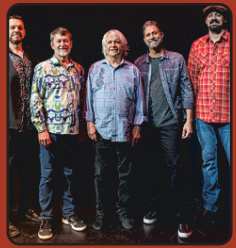
SUN, JUN 18 PURE PRAIRIE LEAGUE