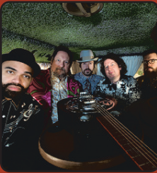
WED, JUL 19 THE JERRY DOUGLAS BAND