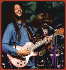
THU, JUN 15 JULIAN MARLEY