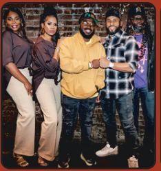
SUN, JUN 25 THE WAILERS