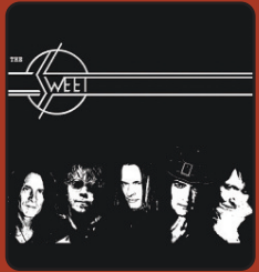
FRI, JUN 30 THE SWEET