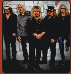
SUN, SEP 24 MOLLY HATCHET