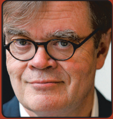
SAT, SEP 30 GARRISON KEILLOR