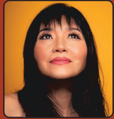
THU, SEP 21 KEIKO MATSUI