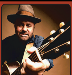
SUN, OCT 29 MARTIN SEXTON