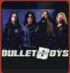
FRI, OCT 6 BULLET BOYS