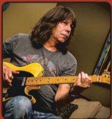
THU, OCT 19 PAT TRAVERS