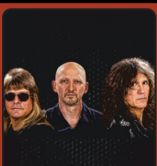
THU, NOV 2 ZEBRA

ticketweb 866.468.3399 | 33157 Camino Capistrano | San Juan Capistrano Like Us on facebook.com/coachhouseconcerthall | follow us on Twitter @coach_house