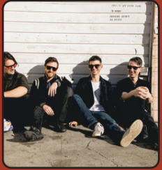
WED, SEP 20 PHANTOM PLANET