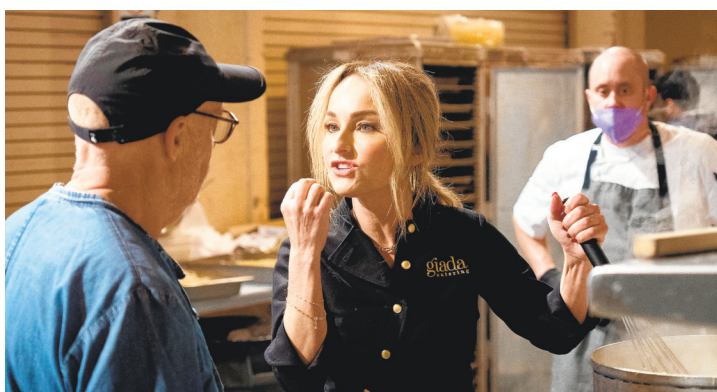
CHEF GIADA DELAURENTIIS served as guest executive chef for the Candlelight Concert.