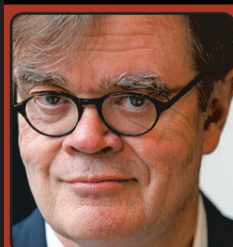
SAT, SEP 30 GARRISON KEILLOR