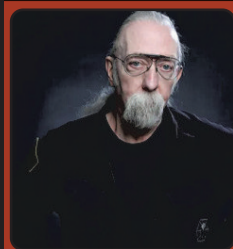
WED, AUG 23 JEFF "SKUNK" BAXTER