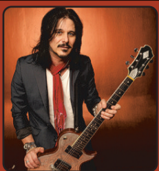
THU, AUG 31 GILBY CLARKE