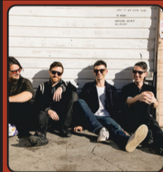
WED, SEP 20 PHANTOM PLANET