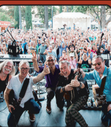
SAT, SEP 16 THE FENIANS