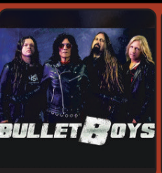
FRI, OCT 6 BULLET BOYS