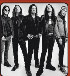
FRI, SEP 1 BANG TANGO