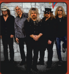
SUN, SEP 24 MOLLY HATCHET