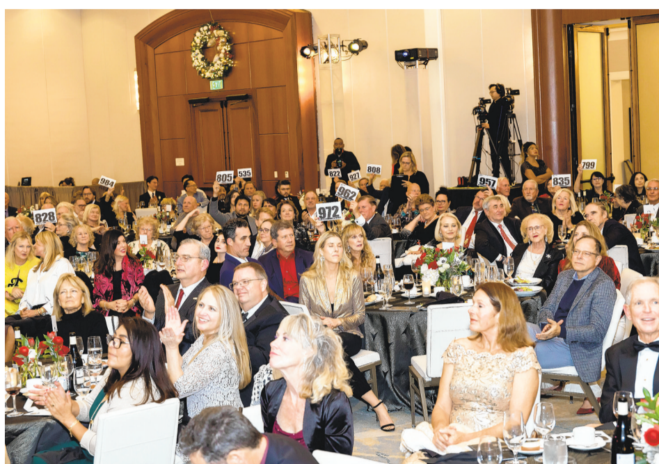
AUCTION BIDDERS help raise an impressive seven-figure sum at recent Salvation Army fundraiser at Balboa Bay Resort.

The $110-million public/private partnership built and operates the wide outreach of services provided to the local unsheltered community. It encompasses a 325-bed emergency shelter, 72 permanent supportive housing apartments and full-time, full-service staff providing medical, dental and even pet care, along