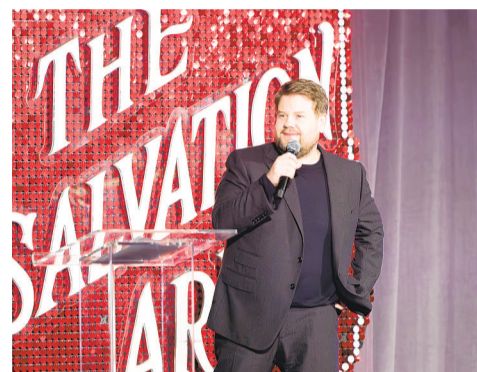
JAMES CORDEN , British comic and former late-night host for CBS entertained the Salvation Army crowd.