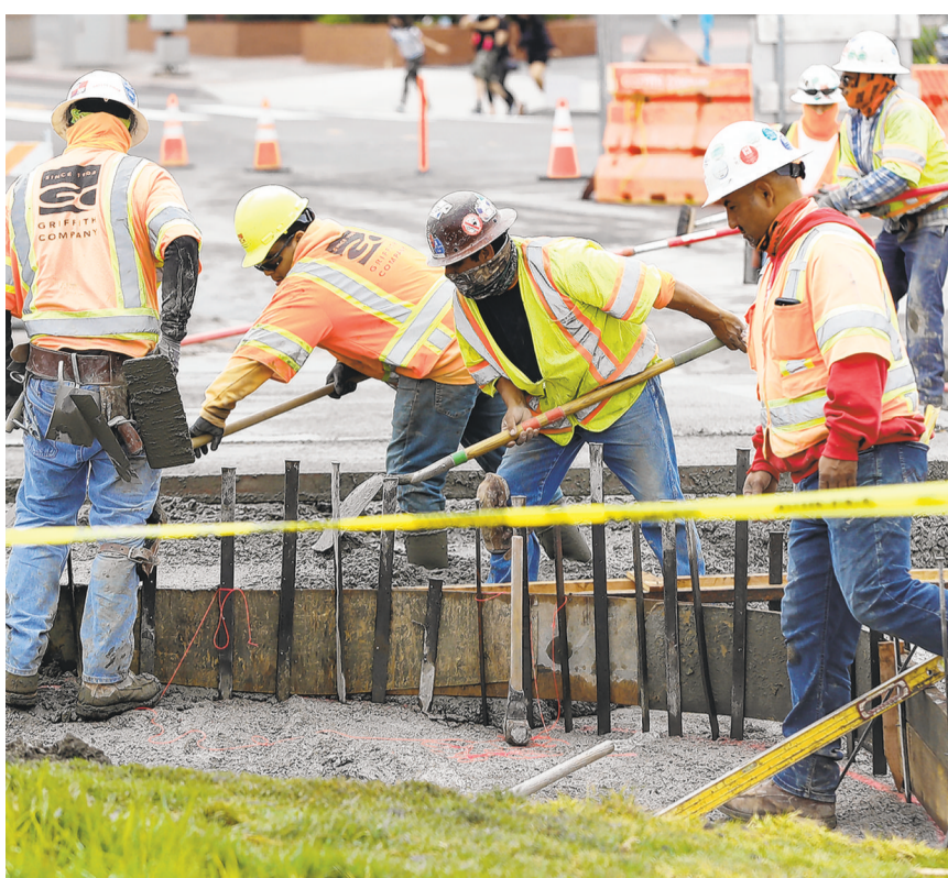
A TEAM OF cement workers pour and fill new cement, making a sidewalk as Caltrans finishes a Laguna Canyon Channel project on Coast Highway in downtown Laguna Beach in May. Preconstruction staging for a sidewalk improvement project along Coast Highway is set to get underway on Tuesday.