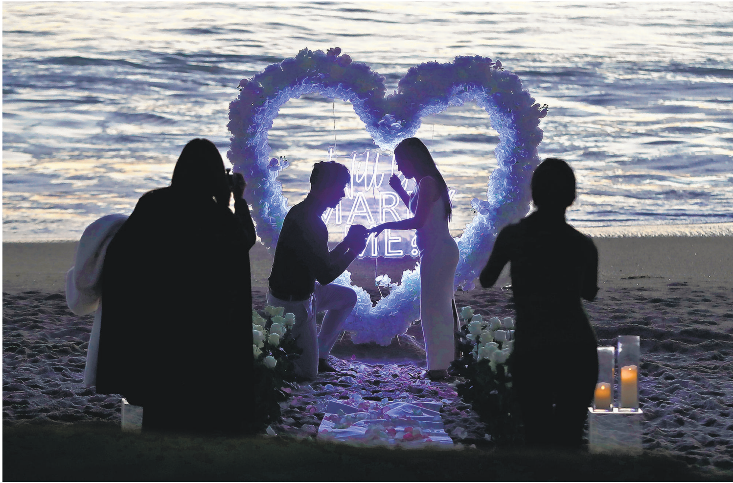
ELABORATE PROPOSAL set-ups illuminate the beach for the big question on the shore near the Montage in Laguna Beach. Proposals like these have increased in popularity at the seaside resort, which has become a go-to proposal spot for future brides and grooms in recent years.

WEDNESDAY, FEBRUARY 15, 2023 /// dailypilot.com