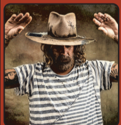
DEC 29 & 30 DONAVON FRANKENREITER