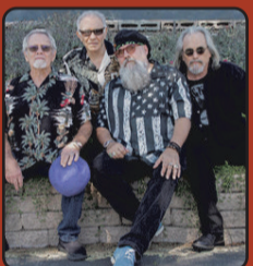
THU, JAN 11 CANNED HEAT