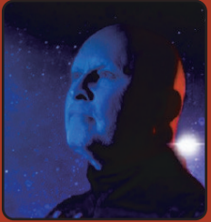
SAT, DEC 23 FLOCK OF SEAGULLS