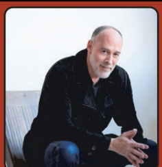
JAN 19 & JAN 20 MARC COHN