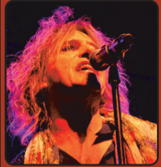
FRI, DEC 8 GENE LOVES JEZEBEL