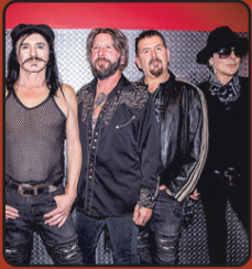
THU, DEC 28 L.A. GUNS