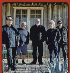
SUN, DEC 31 LOS LOBOS New Year's Eve