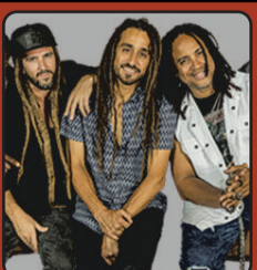
SUN, JAN 21 BIG MOUNTAIN