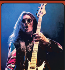
FRI, FEB 2 GLENN HUGHES

ticketweb 866.468.3399 | 33157 Camino Capistrano | San Juan Capistrano Like Us on facebook.com/coachhouseconcerthall | follow us on Twitter @coach_house