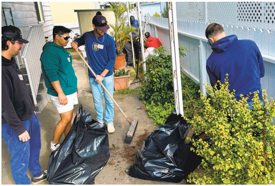
VANGUARD UNIVERSITY students Saturday help clear the yard of a mobile home as part of a Love Costa Mesa neighboring day.