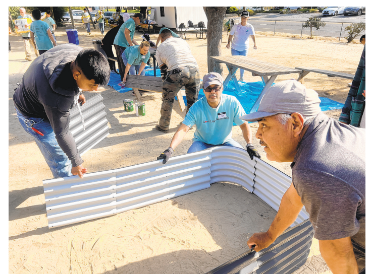
VOLUNTEERS WORK on a beautification project at the Day Laborer Center in Laguna Canyon on Saturday for Love Laguna Beach.