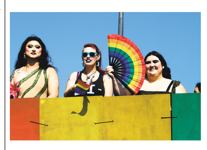
MEMBERS OF the LGBTQ+ community take part in the OC Pride Parade at the OC Fair & Event Center in Costa Mesa.

. Camino Del Rio South, Suite 225 San Diego, California 92108