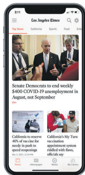
Access today's top stories.