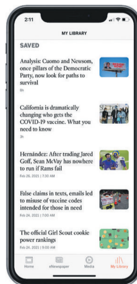
View your recently read and saved stories.