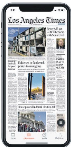
Navigate the newspaper with searchable archives and offline reading.