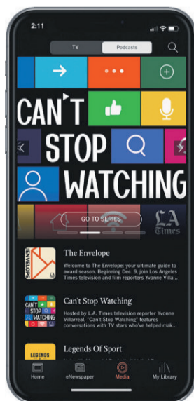
Listen to our podcasts and watch exclusive video content.