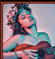
SUN, AUG 4 TAIMANE