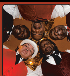
SAT, AUG 10 THE BUSBOYS