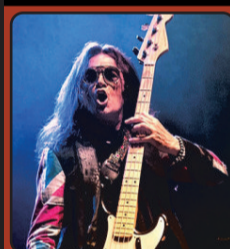
FRI, AUG 30 GLENN HUGHES