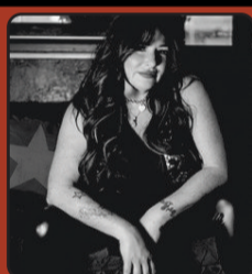
FRI, SEP 6 TIFFANY