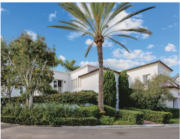
908 Zurich Circle, Lido Isle Sold Price: $5,668,515 / Rep. Seller