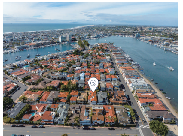
231 Via Firenze, Lido Isle Sold Price: $4,200,000 / Rep. Seller