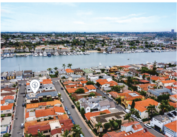
223 Via Orvieto, Lido Isle Sold Price: $3,850,000 / Rep. Buyer & Seller