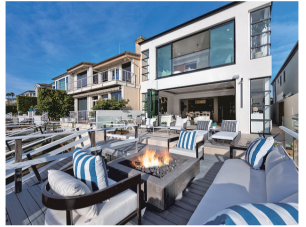
235 Via Lido Soud, Lido Isle Sold Price: $12,500,000 / Rep. Buyer & Seller