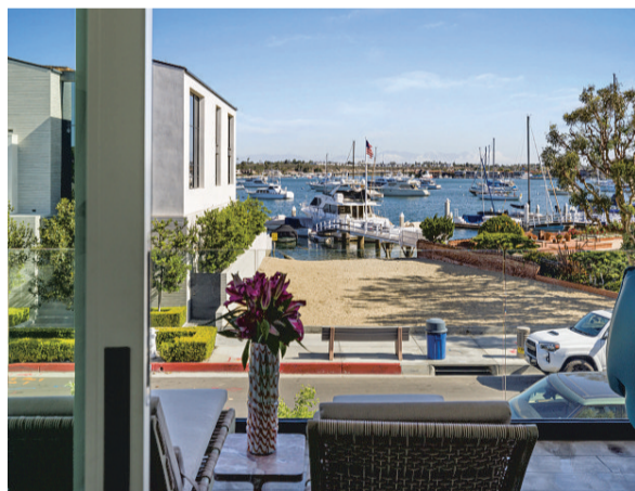
621 West Bay Avenue, Newport Beach Sold Price: $5,250,000 / Rep. Seller