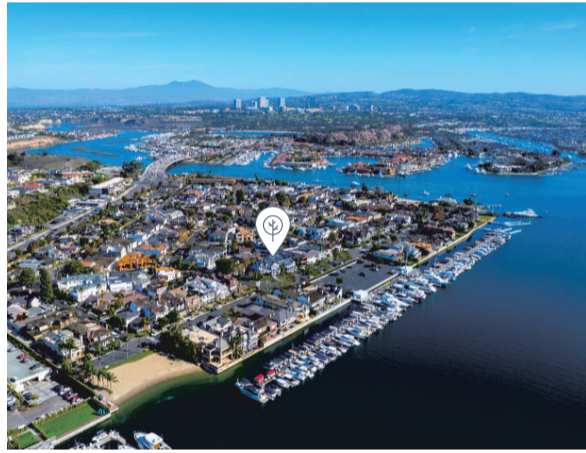
2511 Bayshore Drive, Bayshores Sold Price: $13,000,000 / Rep. Buyer