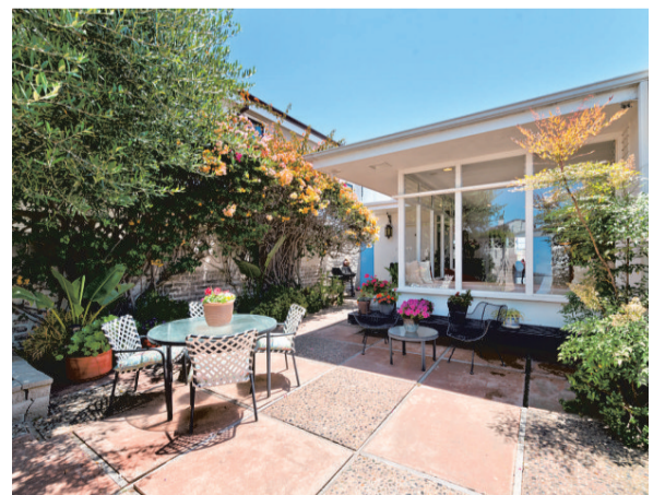
218 Via Ithaca, Lido Isle Sold Price: $3,350,000 / Rep. Buyer & Seller