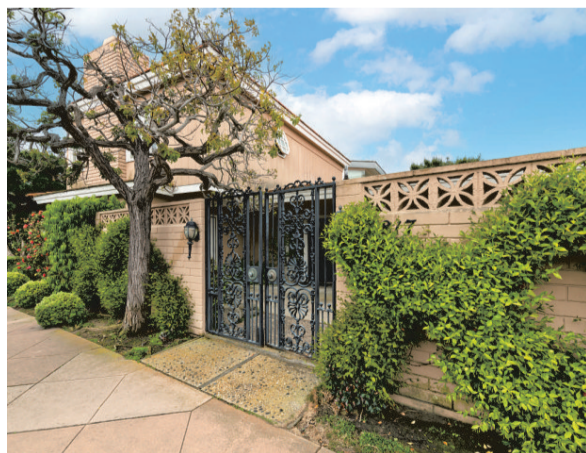
817 Via Lido Nord, Lido Isle Sold Price: $3,350,000 / Rep. Seller