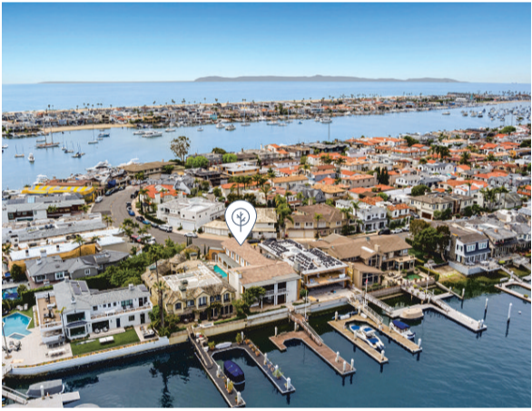
924 Via Lido Nord, Lido Isle Sold Price: $18,750,000 / Rep. Seller