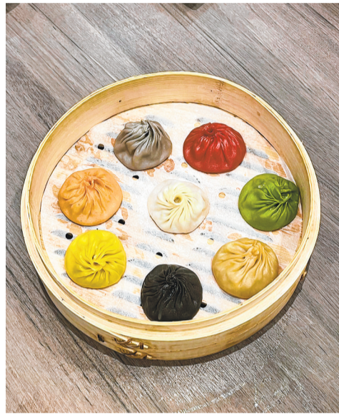
THE RAINBOW Xiao Long Bao dumpling basket at Paradise Dynasty.

Natural dyes are added to the dumpling dough — spinach juice for green, carrots for orange, squid