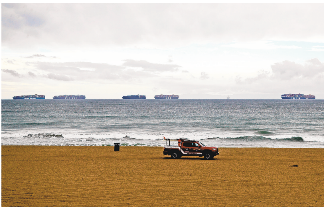
CARGO SHIPS CAN be seen anchored off the coast of Huntington Beach on March 3.

In response to the letter, the city maintains that it has not failed to