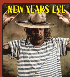
DEC 31 & JAN 1 DONAVON FRANKENREITER