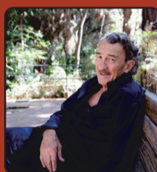
MON, JAN 30 FEE WAYBILL