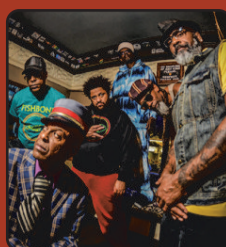
THU, DEC 30 FISHBONE