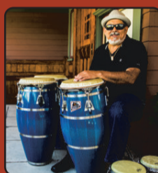
FRI, JAN 28 PONCHO SANCHEZ