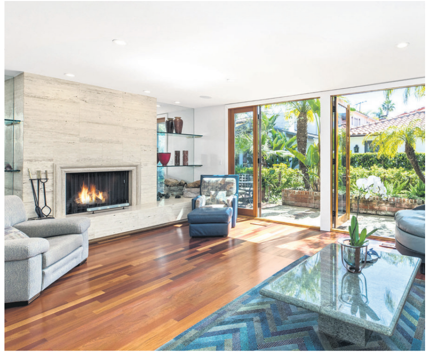
Sold in 7 Days | Lido Isle | 120 Via Quito $2,150,000 | 3 BR, 2.5 BA | Web# NP20080128