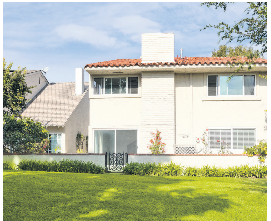
Newport Beach | 323 Vista Suerte $1,574,900 | 4 BR, 2.5 BA | Web# NP19264950