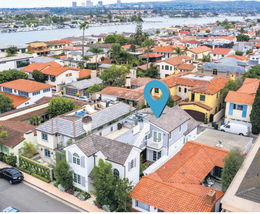
Lido Isle | 208 Via Orvieto $3,595,000 | 4 BR, 4.5 BA | Web# NP19143607