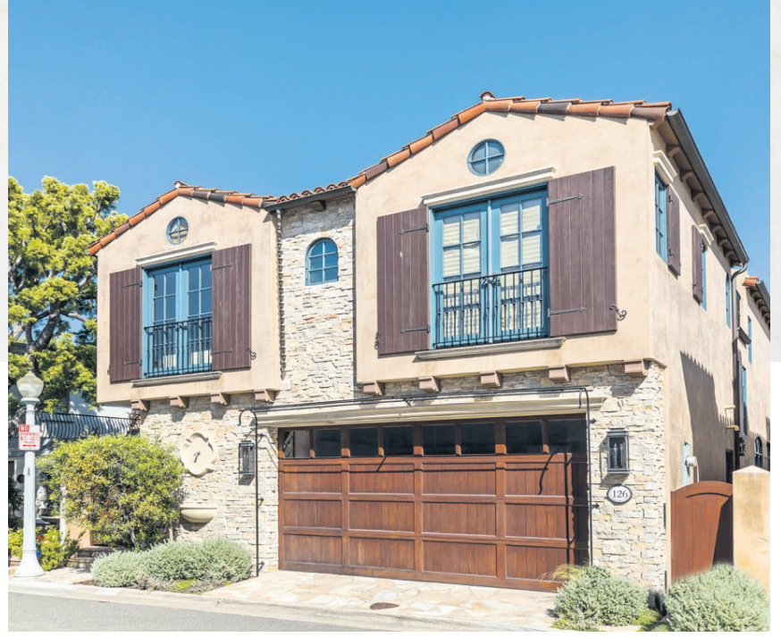
Lido Isle | 126 Via Xanthe $3,550,000 | 4 BR, 4.5 BA | Elevator | Web# NP20072821