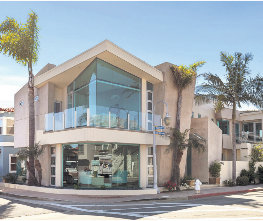
Just Sold | Lido Isle | 545 Via Lido Nord $3,000,000 | 4 BR, 4.5 BA | Web# NP19118725