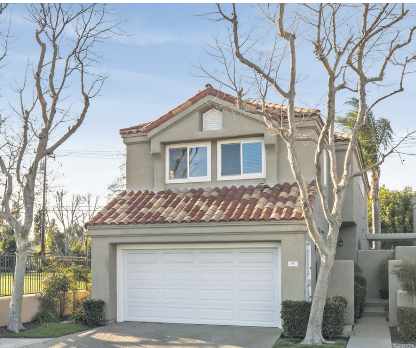
Just Sold | Newport Beach | 99 Pelican Court $1,320,000 | 3 BR, 3 BA | Web# NP20029784