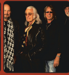
FRI, NOV 17 FOGHAT