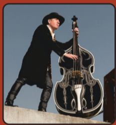
SAT, DEC 2 LEE ROCKER of The Stray Cats