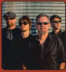
THU, NOV 9 THE YOUNG DUBLINERS