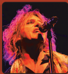
FRI, DEC 8 GENE LOVES JEZEBEL