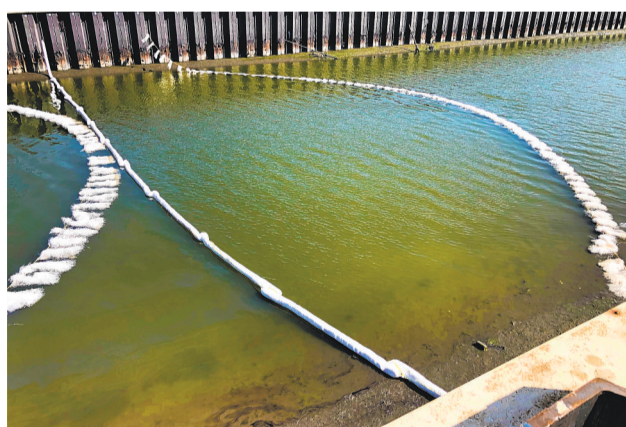
California Department of Fish &amp; Wildlife

Although the collaboration — coming one year after a ruptured underwater pipeline spilled 25,000 gallons of oil into the waters off Huntington Beach — was swift and effective, a dispute later arose in which Orange County and