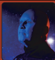
SAT, DEC 23 FLOCK OF SEAGULLS