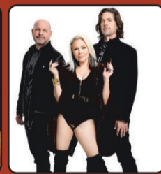
FRI, DEC 15 BERLIN