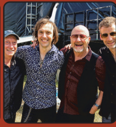
SUN, NOV 12 WISHBONE ASH