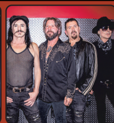
THU, DEC 28 L.A. GUNS