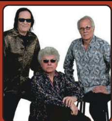
FRI, DEC 22 AMBROSIA