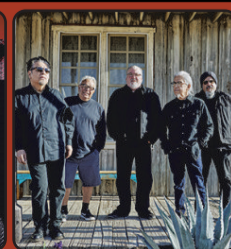
SUN, DEC 31 LOS LOBOS New Year's Eve

ticketweb 866.468.3399 | 33157 Camino Capistrano | San Juan Capistrano Like Us on facebook.com/coachhouseconcerthall | follow us on Twitter @coach_house