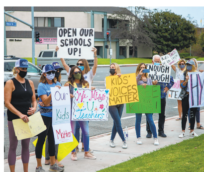
STUDENTS and parents protest outside the Newport-Mesa Unified district office on Oct. 23.

Several members of the public, including elementary school employees, tuned into Thursday's virtual meeting to urge district leaders to return all schools to distance learning as a precaution against a post-holiday coronavirus surge.