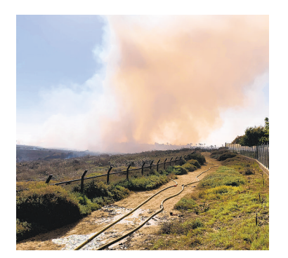
Huntington Beach Fire Department

FIREFIGHTERS ON Sunday quickly brought under control most of a small brush fire that burned in the Bolsa Chica wetlands area of Huntington Beach.