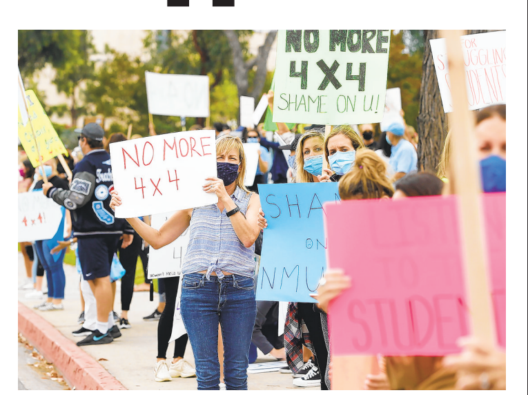
A CROWD PROTESTS the NMUSD learning schedule. On Tuesday, the district repealed the plan for all schools but Estancia High.

ments, some in support and many opposed to this model," Lee-Sung said.