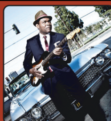
SAT, JAN 28 ROBERT CRAY