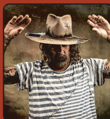
WED, DEC 28 DONAVON FRANKENREITER