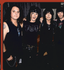
FRI, DEC 30 L A GUNS