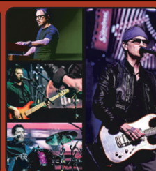
THU, FEB 9 BODEANS