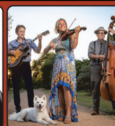
THU, MAR 16 HOT CLUB OF COWTOWN

ticketweb 866.468.3399 33157 Camino Capistrano | San Juan Capistrano Like Us on facebook.com/coachhouseconcerthall | follow us on Twitter @coach_house