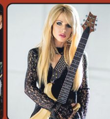
THU, JAN 26 ORIANTHI