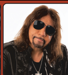
THU, FEB 23 ACE FREHLEY