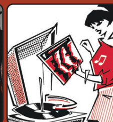
DEC 31 & JAN 1 THE ENGLISH BEAT