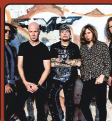
THU, DEC 29 Jack Russell's GREAT WHITE