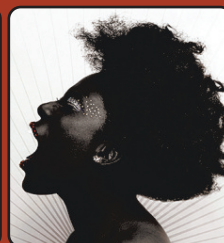
TUE, JAN 19 MACY GRAY