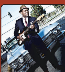
SUN, DEC 12 ROBERT CRAY