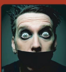
SAT, OCT 16 TAPE FACE