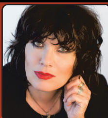
FRI, AUG 6 THE MOTELS