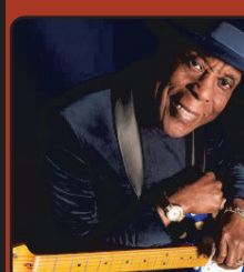
WED, SEP 8 BUDDY GUY