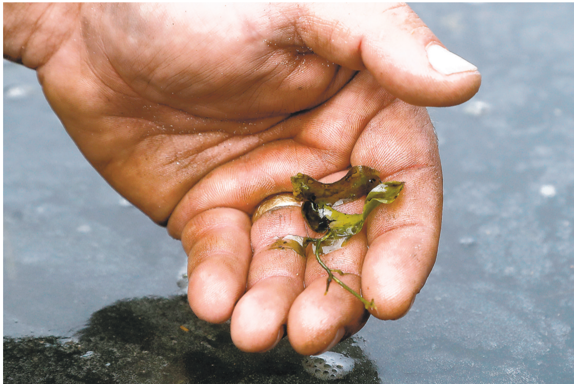
MOONEY SHARES pieces of an invasive algae species, scientifically known as Caulerpa prolifera , that was filtered through a filtration system set up at China Cove Beach in Newport Beach on Wednesday.

It is not harmful to humans, but it is known to grow quickly and choke out native seaweeds, which could damage Newport Harbor's ecosystem. The algae is capable of recolonizing by fragmentation, according to Becky Ota, marine habitat conservation