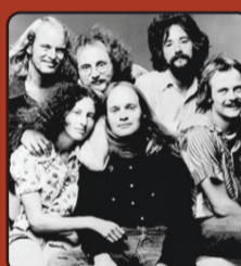
FRI, AUG 13 HONK