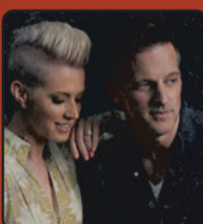
SUN, SEP 5 THOMPSON SQUARE