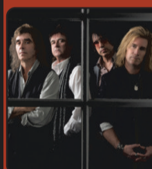
SAT, AUG 7 THE BABYS