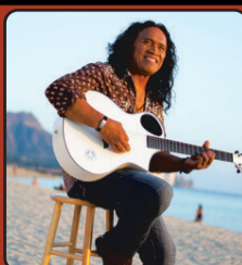
THU, JUL 15 HENRY KAPONO