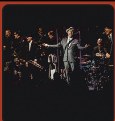
FRI, AUG 9 BIG BAD VOODOO DADDY