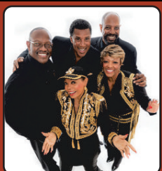
FRI, JUL 19 THE 5TH DIMENSION