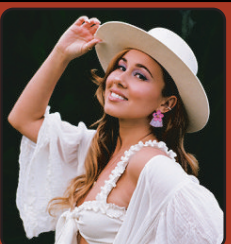
MON, JUL 24 HALEY REINHART