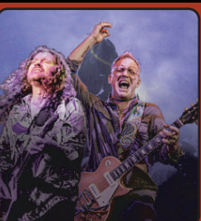
TUE, AUG 27 TAB BENOIT ANDERS OSBORNE