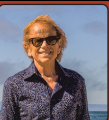
FRI, AUG 2 BEACH BOY AL JARDINE