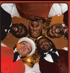
SAT, AUG 10 THE BUS BOYS