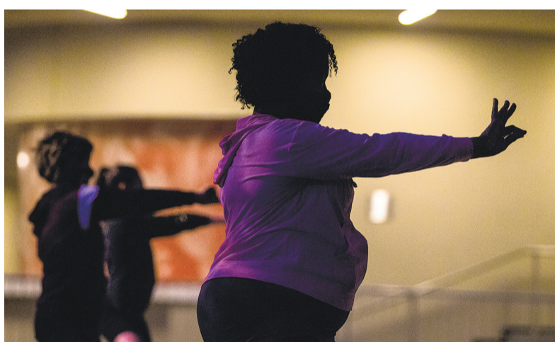
DANCERS participate in a Tuesday night dance class at the Segerstrom Center for the Arts.