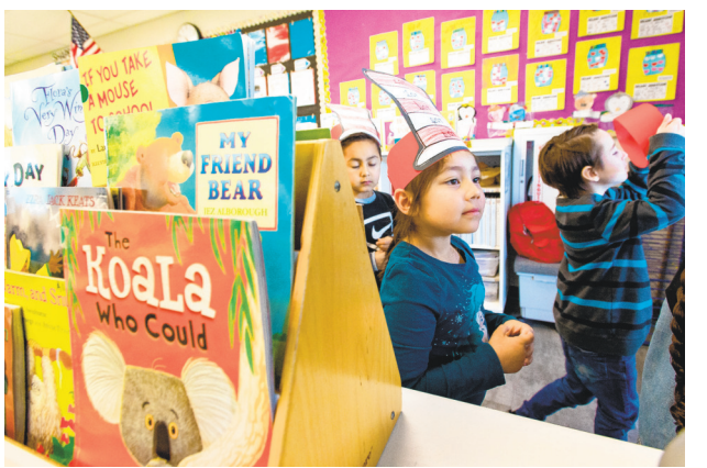
PETERSON ELEMENTARY preschoolers don red and white striped headgear inspired by "The Cat in the Hat" to celebrate the late Dr. Seuss' birthday.

Published: Daily Pilot [1ST ADVERTISEMENT February 24, 2023] [2ND ADVERTISEMENT March 3, 2023]