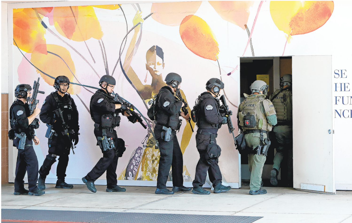
SWAT TEAM members enter the former Sears building during a training exercise on Thursday at South Coast Plaza in Costa Mesa.

FRIDAY, SEPTEMBER 17, 2021 // Now including Coastline Pilot and Huntington Beach Independent // dailypilot.com