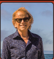
FRI, AUG 2 BEACH BOY AL JARDINE