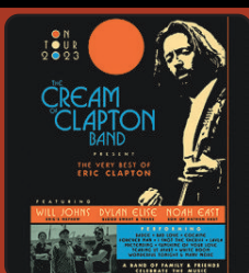
SUN, JUL 14 CREAM OF CLAPTON