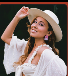
MON, JUL 24 HALEY REINHART