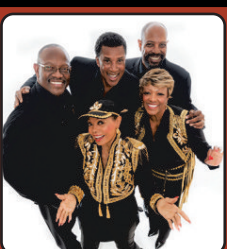
FRI, JUL 19 THE 5TH DIMENSION