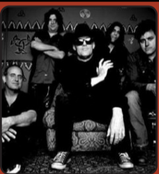
SAT, DEC 28 DRAMARAMA