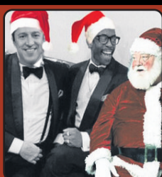
THU, DEC 12 THE RAT PACK