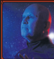
FRI, DEC 20 FLOCK OF SEAGULLS