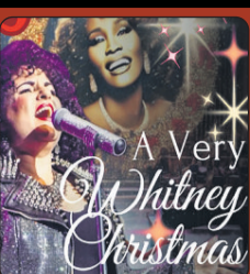
THU, DEC 19 VERY WHITNEY CHRISTMAS