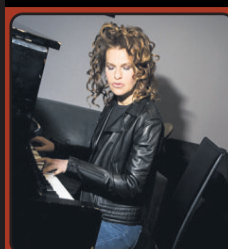
SUN, DEC 8 SANDRA BERNHARD