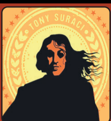
SAT, DEC 14 THE HIGHWAYMAN