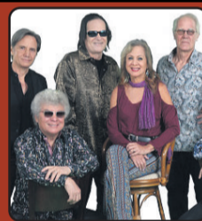
SAT, DEC 21 AMBROSIA