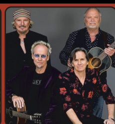
SAT, MAY 18 VENICE