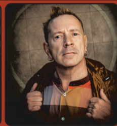
SUN, SEP 8 JOHN LYDON