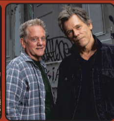
FRI, JUN 28 BACON BROTHERS