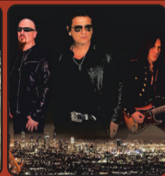
SAT, JUN 1 STEELHEART