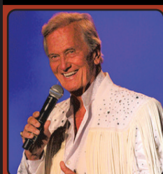
SAT, MAY 11 PAT BOONE