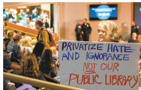
A WOMAN holds a sign in support of keeping Huntington Beach's libraries public.