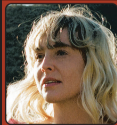
THU, MAY 23 LISSIE