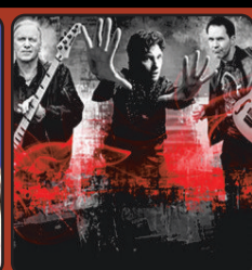
WED, MAY 15 MR. BIG