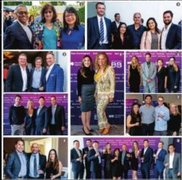
Business Leadership Awards & Forum Events