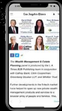
Business Advisory Roundtables

We connect business leaders With industry experts